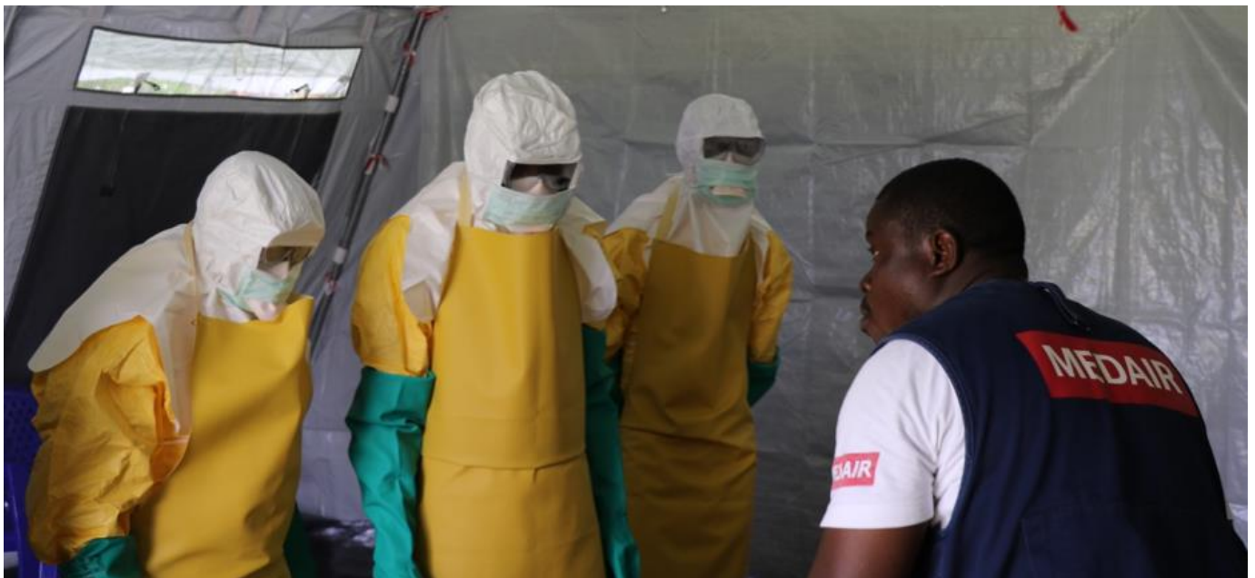
During a practical demonstration, Oicha Referral Hospital staff listen as Medair WASH supervisor Guyguy explains how to safely clean up a spill when caring for an Ebola patient.

The health centres that Medair supports are included as an annex.